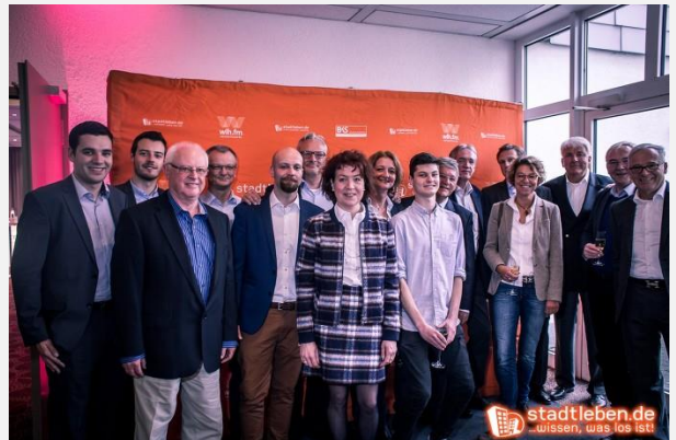
PGUB Team with external partners